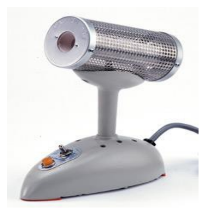
Figure 2. Bacticinerator®

Disposable plastic lab ware (pipettes, & loops for streaking agar plates) should be used instead of metal implements. If there is no alternative to re-useable implements, a "Bacti Cinerator"® (a portable, electric furnace) may be used to sterilize loops, needles, and scalpels instead of alcohol or Bunsen burners.